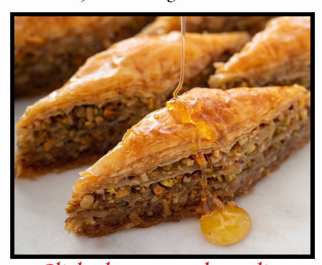
Click above to order online

Your baklava order will be freshly baked and ready for pickup on Saturday, December 14, 1:00 to 4:00pm. Optional pickup date for parishioners is Sunday, December 15 following the Divine Liturgy.