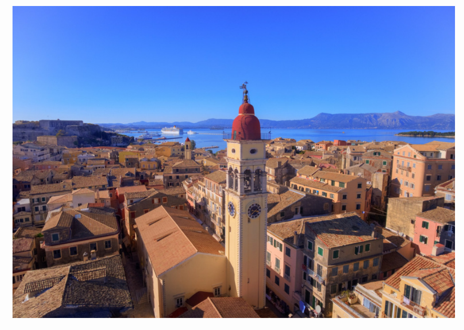
St. Spyridon Churcin Corfu, Greece