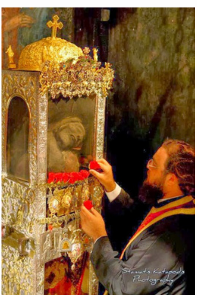
The relics of St. Spyridon in Corfu, Greece