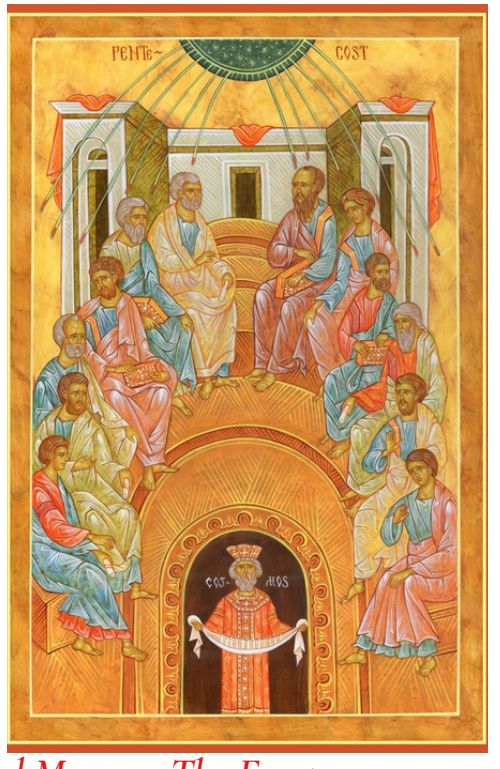
Click Each Image to Read More on The Feasts

Ascension: Vigil (Vespers & Orthros) on Wednesday, June 12 at 6:00p; Festal Liturgy on Thursday, June 13 at 9:00a (all services at St. John Orthodox Church in Rogers) Pentecost: 9:00a Festal Orthros and 10:00a Liturgy on Sunday, June 23 with Parish Festal Potluck; Kneeling Vespers at 1:00p